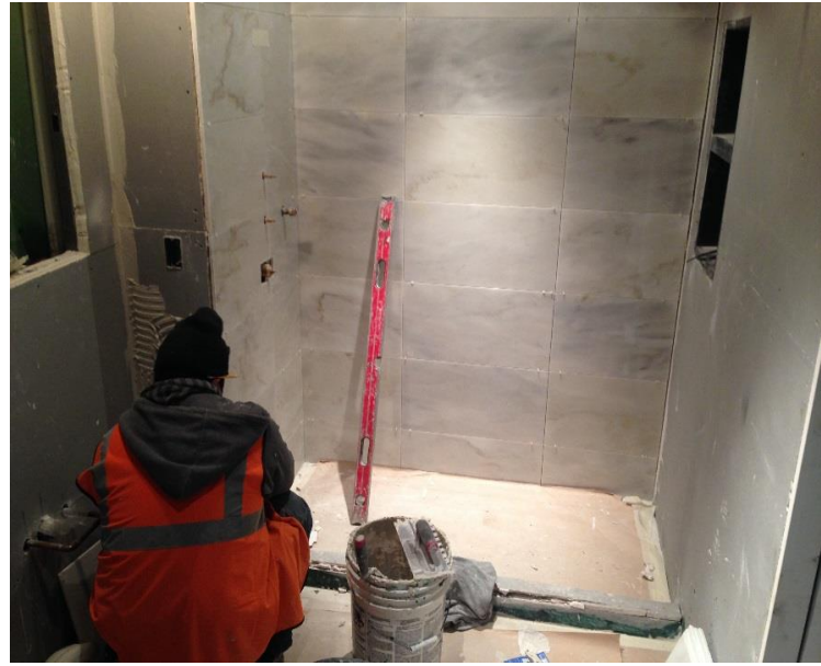
Installing wall tile on the 15th floor.