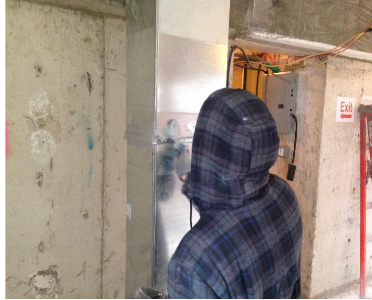
Sealing duct risers from the 37th floor to the 44th floor.