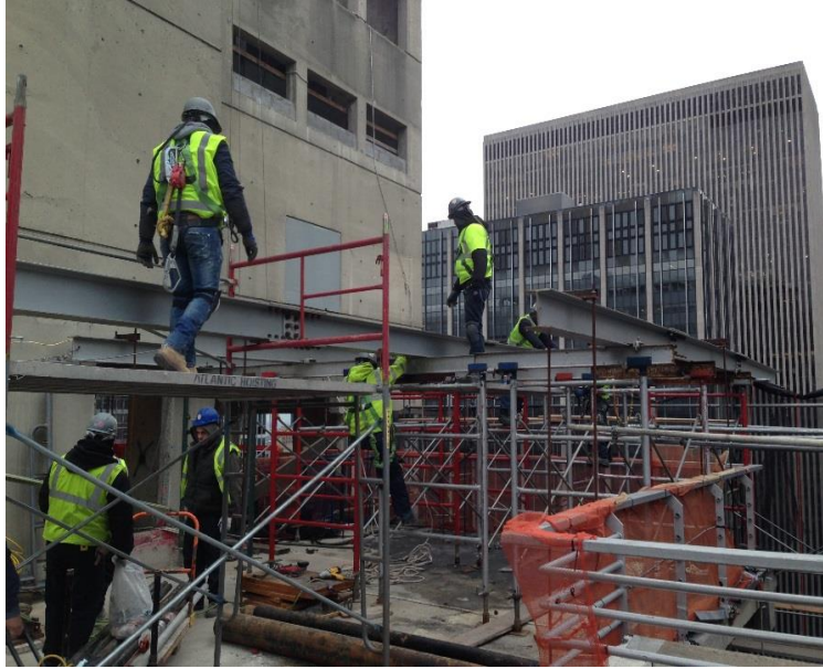
Removing needle beams on the roof.