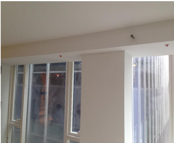
Pure Green priming apts on the 14th floor.