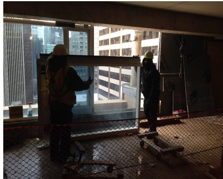
Installing Curtain Wall windows on the 33rd and 34th floors for the spine.