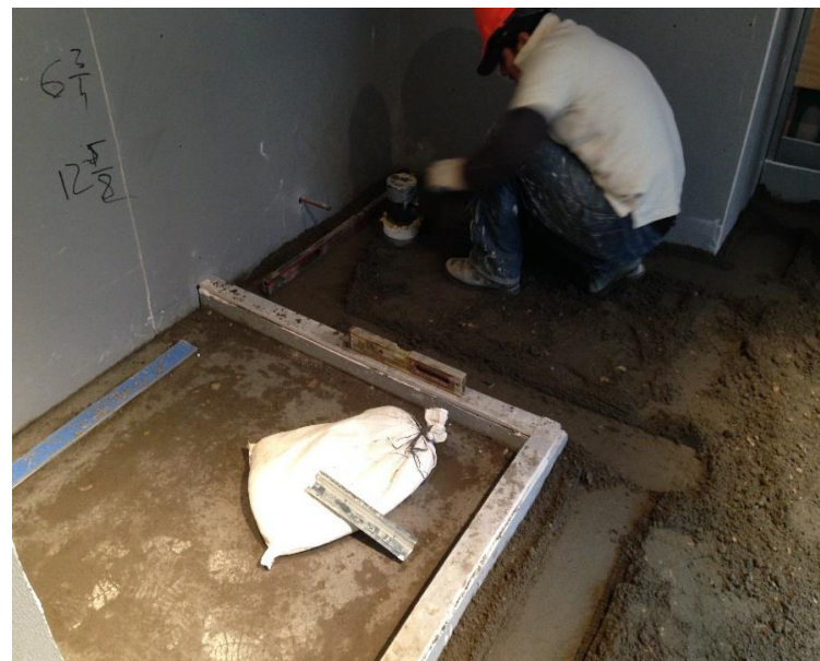
Tile applying mud jobs on the 18th floor for all bathrooms and showers.