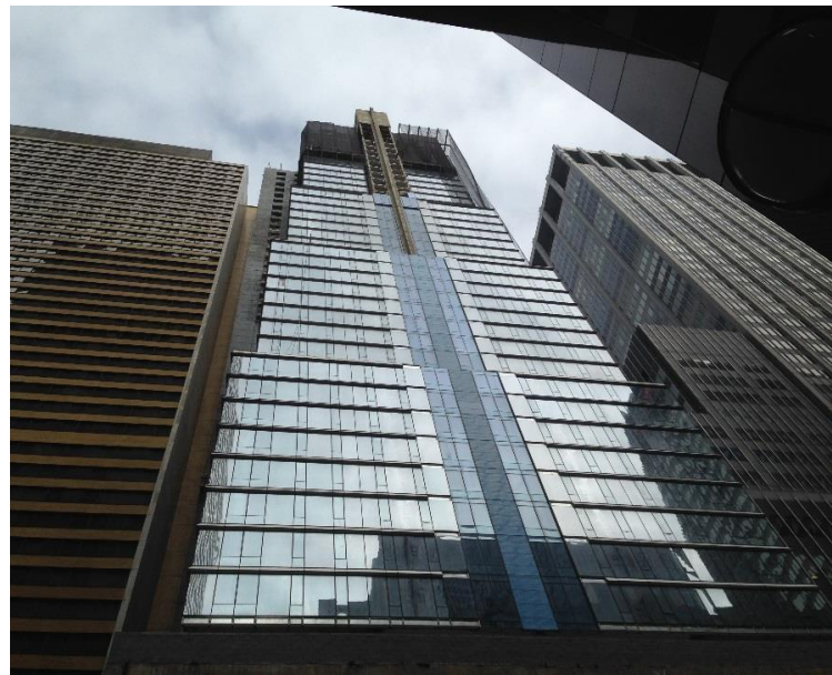
Removing the vertical neting on the South/ West elevation.