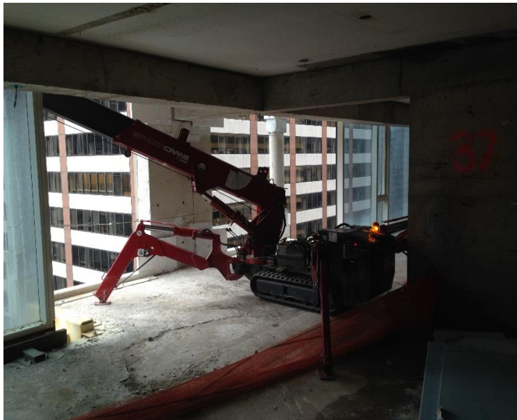
Installing windows on the 33rd and 34th floors and hoisting from the 37th