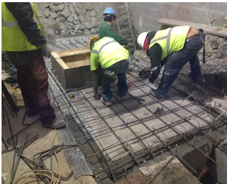
Pure Green installing rebar for the top of the surge tank in cellar.